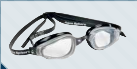
P/N 173000 SILVER / BLACK CLEAR LENS BLACK STRAP