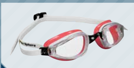
P/N 173280 WHITE / CORAL CLEAR LENS WHITE STRAP