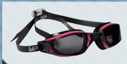
P/N 139040 PINK / BLACK DARK LENS BLACK STRAP