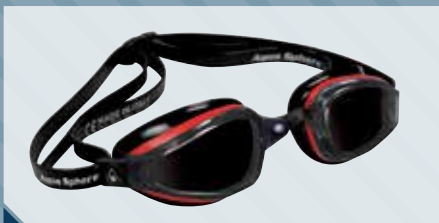
P/N 173040 RED / BLACK DARK LENS BLACK STRAP