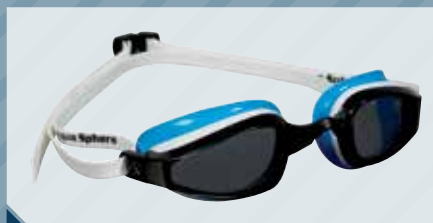
P/N 173290 WHITE / BAHIA DARK LENS WHITE STRAP