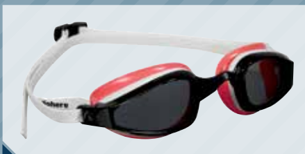
P/N 173300 WHITE / CORAL DARK LENS WHITE STRAP