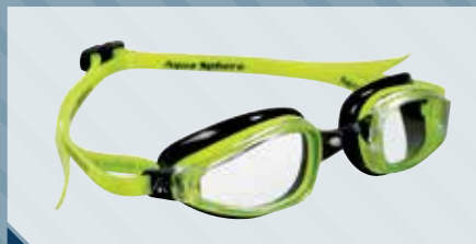
P/N 173240 YELLOW / BLACK CLEAR LENS YELLOW STRAP