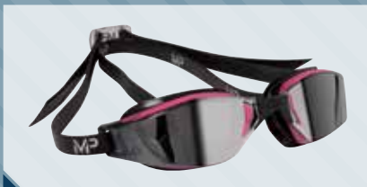
P/N 139070 PINK / BLACK MIRROR LENS BLACK STRAP