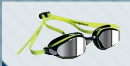
P/N 173520 NEON / BLACK MIRROR LENS YELLOW STRAP