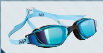
P/N 139080 BLUE / BLACK TITANIUM MIRROR BLUE LENS BLUE STRAP