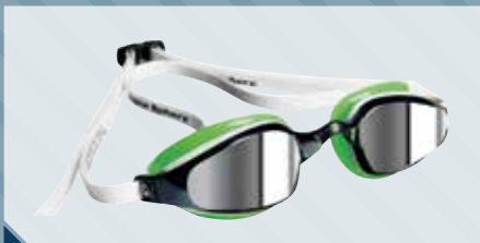
P/N 173530 WHITE / BLACK MIRROR LENS WHITE STRAP