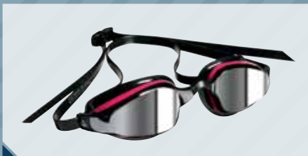
P/N 173550 PINK / BLACK MIRROR LENS BLACK STRAP