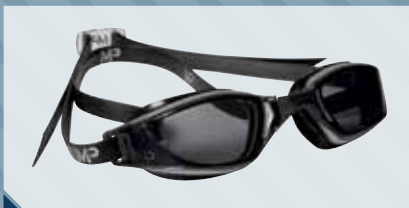
P/N 139030 GREY / BLACK DARK LENS BLACK STRAP