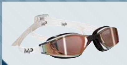
P/N 139090 WHITE / BLACK TITANIUM MIRROR GOLD LENS WHITE STRAP