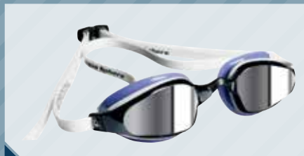
P/N 173560 WHITE / LAVENDER MIRROR LENS WHITE STRAP