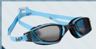
P/N 139020 BLUE / BLACK DARK LENS BLUE STRAP