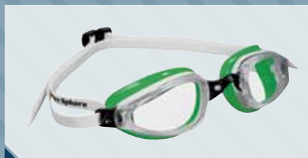
P/N 173410 WHITE / GREEN CLEAR LENS WHITE STRAP