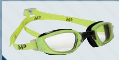
P/N 139000 YELLOW / BLACK CLEAR LENS YELLOW STRAP