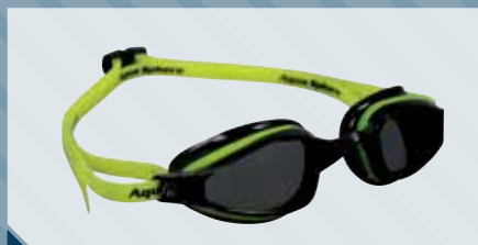
P/N 173260 YELLOW / BLACK DARK LENS YELLOW STRAP