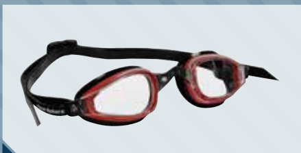
P/N 173020 RED / BLACK CLEAR LENS BLACK STRAP