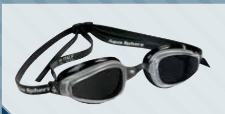
P/N 173030 SILVER / BLACK DARK LENS BLACK STRAP