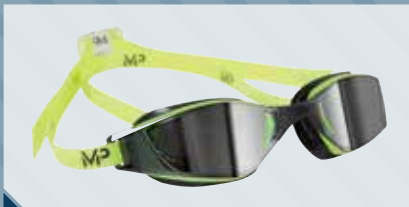
P/N 139060 YELLOW / BLACK MIRROR LENS YELLOW STRAP