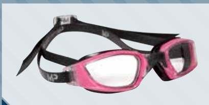
P/N 139010 PINK / BLACK CLEAR LENS BLACK STRAP