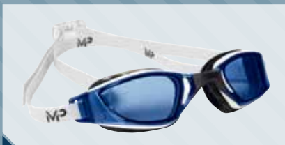
P/N 139050 WHITE / BLACK BLUE LENS WHITE STRAP