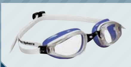
P/N 173420 WHITE / LAVENDER CLEAR LENS WHITE STRAP