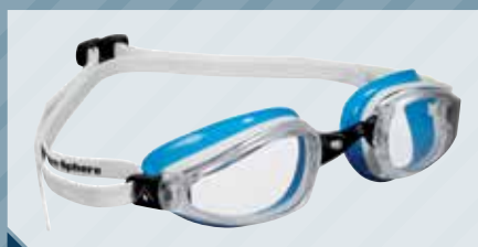
P/N 173270 WHITE / BAHIA CLEAR LENS WHITE STRAP